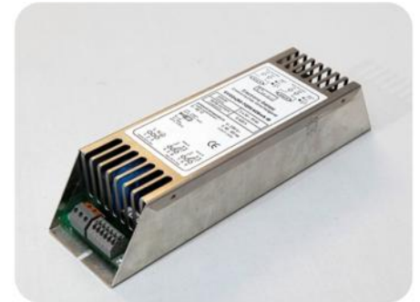
Efficient electronic ballast matched to the ultraviolet lamp, 110-240VAC