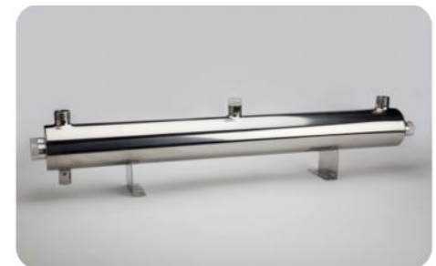
Polished AS316 Chamber