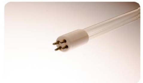
High quality long life UV lamps emitting germicidal ultraviolet light at 254nm